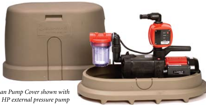
Bushman Pump Cover shown with ¾ HP external pressure pump

B ushman offers an external pressure pump kit for above ground rainwater harvesting systems used for irrigation and drip systems. The kit contains a ¾HP external pressure pump, a pump housing and a pump connection kit. Step-by-step instructions are also included for easy installation. Pump housing protective covers are available in five popular colors to match the color of your Bushman rainwater harvesting tank.